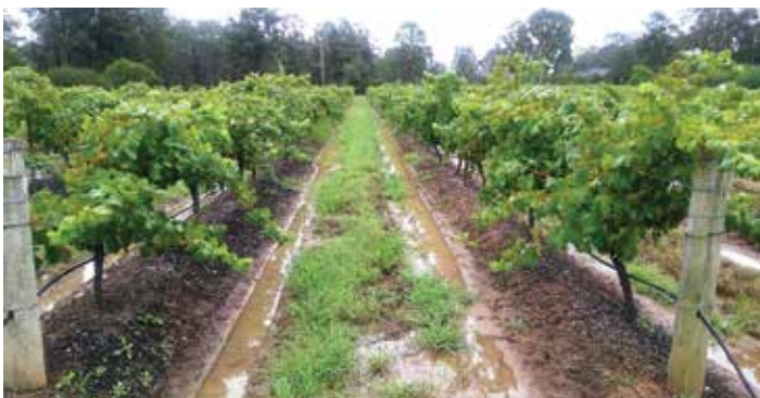
Flooded Semillon at Mistletoe – 6 th January 2016

The weather started to look ominous around January 2 nd and we then experienced localised hail storms, rain and flooding, on the 4 th , 5 th and 6 th January. The rain at Mistletoe on January 6 th totalled over 100mm with it coming down faster than the storms we experienced when the Pasha Bulka